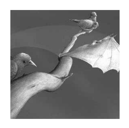
Pip, Flitter, and Flap landed gracefully on a branch. Stellaluna tried to do the same.