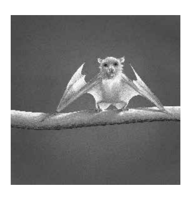
I will fly all day, Stellaluna told herself. Then no one will see how clumsy I am.